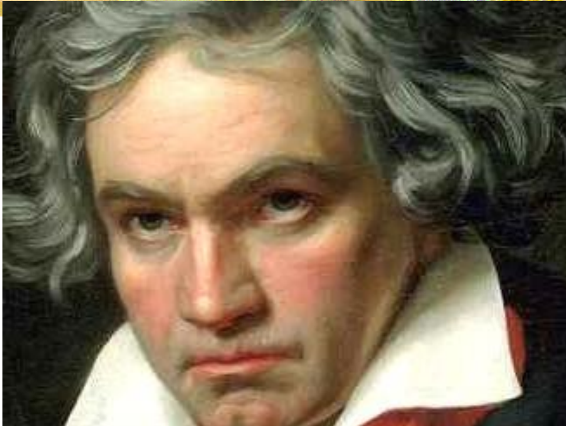
Ludwig van Beethoven German composer and pianist